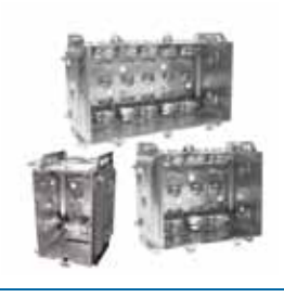
Iberville® LHTQ™ Boxes