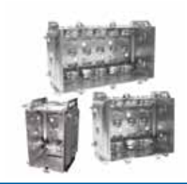
Iberville ® LHTQ™ Boxes