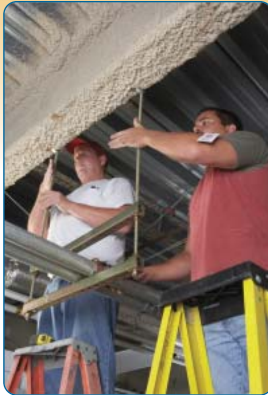
Standard installation requires manual threading of bolt on threaded rod.