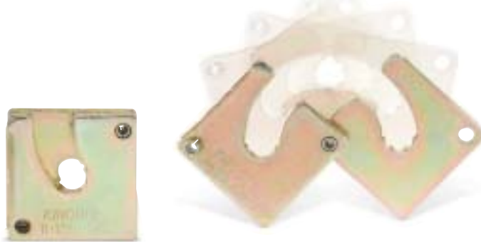
H 122 3/8 Trapnut™ Strut Fastener Galvkrom™