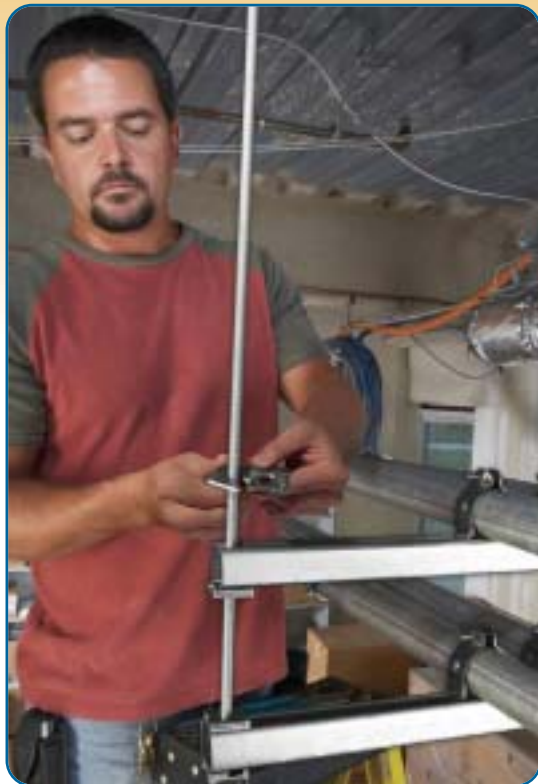
The unique scissor action of the Trapnut™ allows it to be positioned anywhere on the threaded rod.