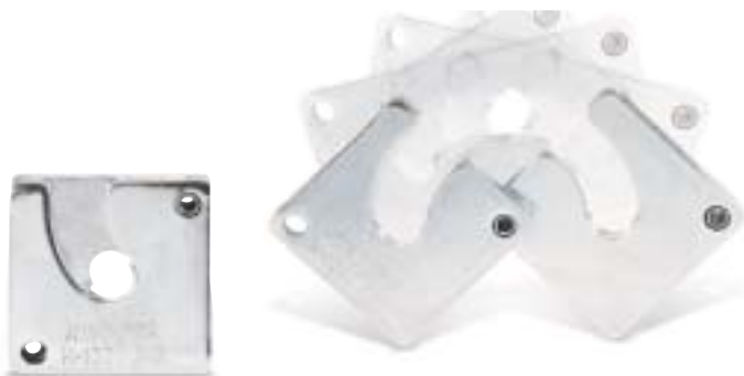
H 122 3/8 EG Trapnut™ Strut Fastener SilverGalv™