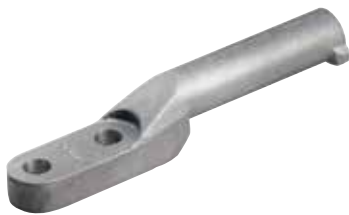
PT 2 N 795