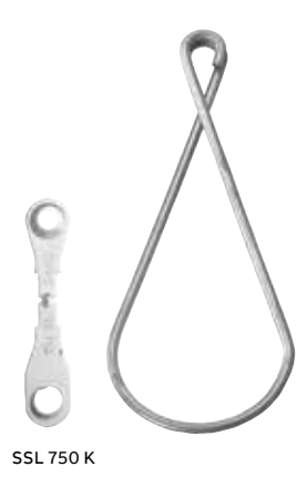
SSL – Link kits

Note: Kit consists of two sockets, one neutral socket, two pin terminals, one neutral pin terminal, one SSL Link Kit (breakaway link and bail), two Flood-Seal insulating splice covers and one Flood-Seal insulating rocket.