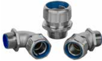
Series 5300-NB Nickel Plated Brass Liquidtight