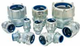
Series 5300 Steel Liquidtight

Series 5300 - Steel/Series 5300-NB - Nickel Plated Brass