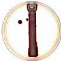
Standard cable tie after 24 hours of exposure to bacteria

In response to the needs of customers in healthcare, food processing and preparation, pharmaceuticals, medical device manufacturing and other contamination-sensitive industries, ABB introduces the industry's first bacteria resistant cable tie. Ty-Fast Ag+ bacteria-resistant cable ties are molded from an FDA-compliant nylon resin blended with an antimicrobial silver ion additive to prevent the growth of bacteria, fungus and mold on their surface.