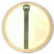
Ty-Fast Ag+ after 24 hours of exposure to bacteria

A breakthrough safety solution for fastening in bacteria-prone areas. A standard nylon cable tie is a harmless enough object—you install it to bundle and fasten cables, and then you forget about it. By its very design, full of notches and grooves, though, a cable tie makes an attractive home for micro-organisms to collect and reproduce. In most applications, this isn't a concern. However, in hospitals and food processing facilities, where reducing the growth of unhealthy micro-organisms is critical, the presence of heat, moisture and organic material common in these environments can encourage the growth of bacteria, fungus and mold.